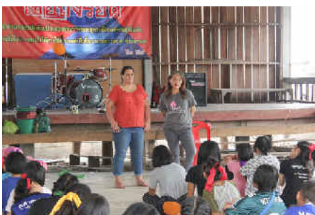
Kids Camp on the Thai-Karen Border