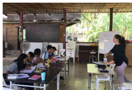
Bible classes begin at ATM