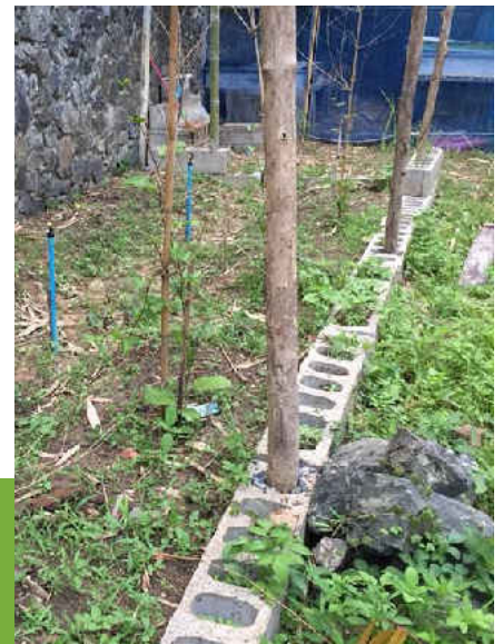
ATM FARM & BUILDING PROJECTS