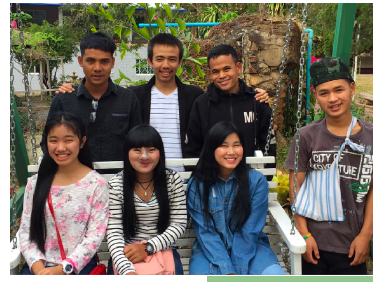
3 NEW STUDENTS WELCOMED THIS TERM

This year over 30 attended and shared their testimonies of how God has continued to lead and guide them and is opening doors for them to influence their villages and communities. Most of them are leaders in some capacity which is awesome to see!