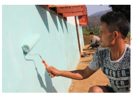
ATM Students community outreach at Nu's Village