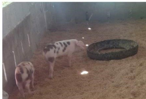
New pigs on the farm!