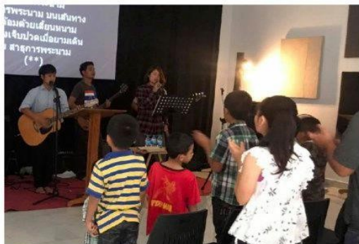
Sunday Church Service on base