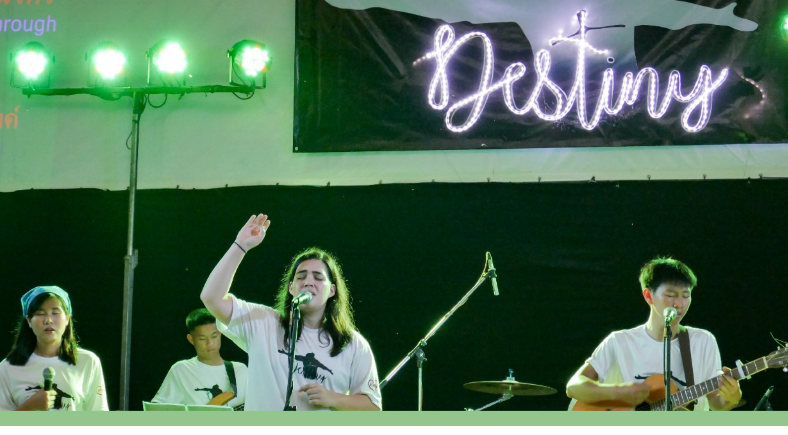
Fire Camp 2018

We were blown away by the miraculous provision and fulfillment of the word and vision for this year's Fire Camp.