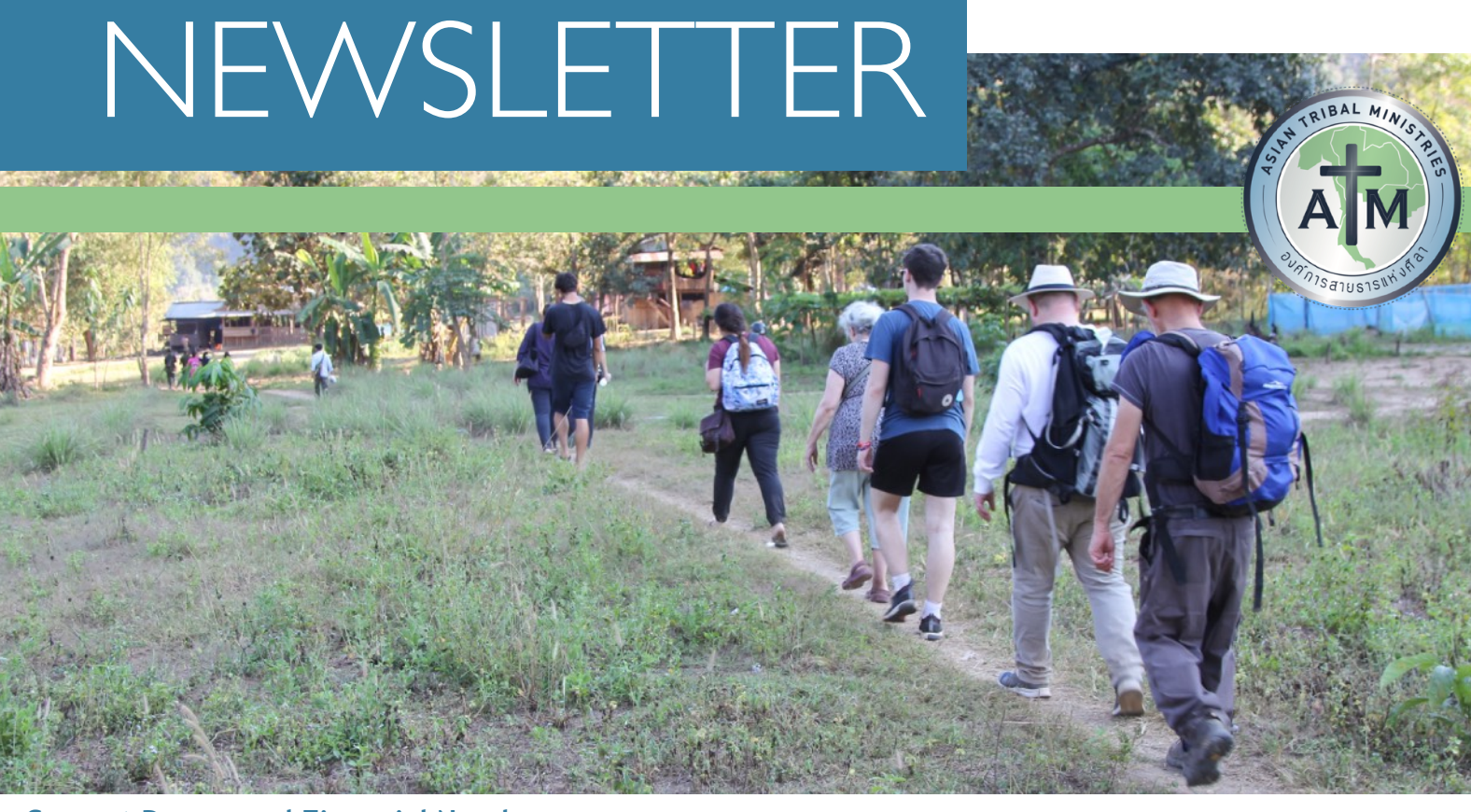
Current Prayer and Financial Needs

We continue to be amazed at God's provision and timely donations sent just when we need them. We sincerely want to thank you all for listening to the prompts of the Holy Spirit to give often when we have not dared to ask. And for those who so generously have given when we have requested help throughout the year. We do not take any of this for granted and are forever grateful. We are thankful that we can partner together for the work of the Kingdom here in Thailand.