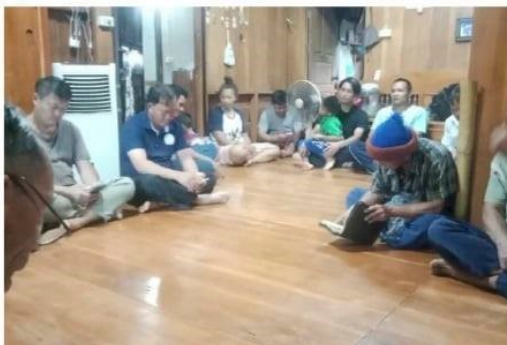
Visiting and encouraging House Churches