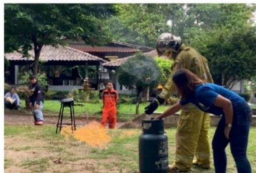
First Fire Drill at ATM