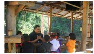
UPCOMING AT ATM STUDENT REUNION RENOVATIONS REOPENING DTS OUTREACHES