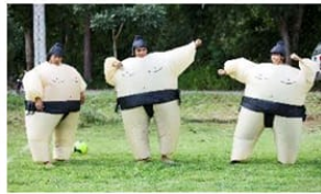
FIRE CAMP 2022-2023 PREPARATIONS FUNDRAISING PRAYER