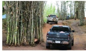
AID DISTRIBUTION AMOUNT DELIVERED NEW IDP AREAS CAR UPGRADES